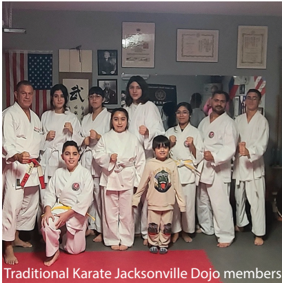
Traditional Karate Jacksonville Dojo members

As the year 2022 comes to an end, we continue to resume our activities after the end of the pandemic that has held us still for the past two years. Fortunately, Japan has opened its borders giving us the opportunity to plan a future trip to reconnect with Kokusai Budoin HQ Japan.