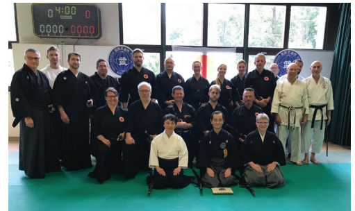
Iaido Seminar Participants

Members and friends gathered for two days of intense practice, to celebrate old and new friendships, and to hold the annual officers' meeting.