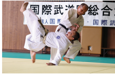
Okinawa Kobudo Demonstration